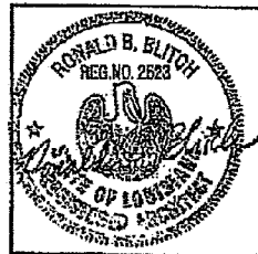
Designer's Professional Seal